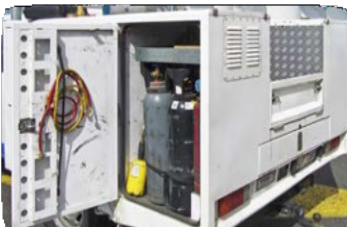
Purpose build sealed compartment